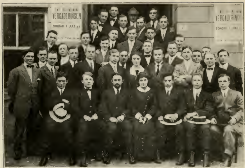
FORMER STUDENTS OF THE LATTER-DAY SAINTS' UNIVERSITY, Missionaries in the Netherlands-Belgium and Swiss and German Missions. Taken at Rotterdam, July 8, 1912.